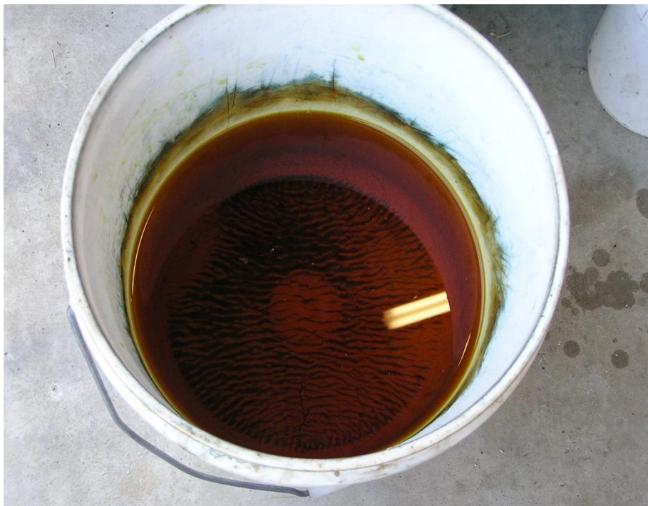
Alochrome Solution mixed 7.5g/L of Water in a Sealed Bucket