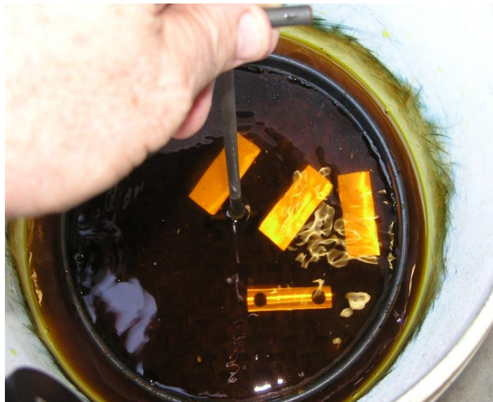
Many parts can be done at once in a basket.

The parts must be continuously agitated during the process with this method.